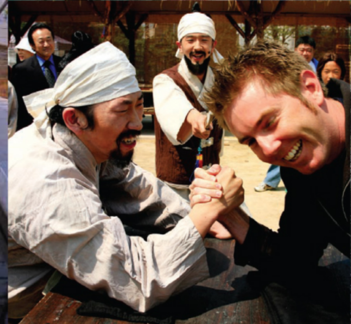
Congress Venue: National Museum of Korea